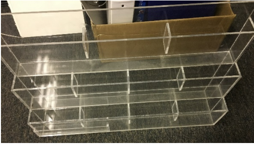
Plexiglass pamphlet rack and Metal picture frames